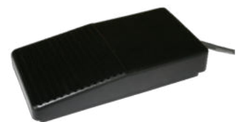
4472 Foot switch