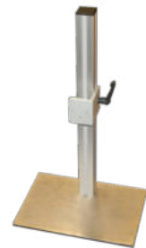
2400 Stand, small